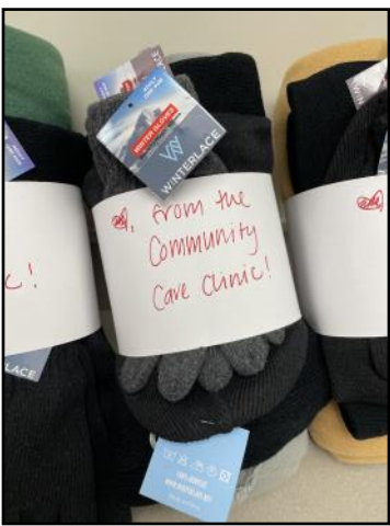
Coat Drive & Winter Bundles