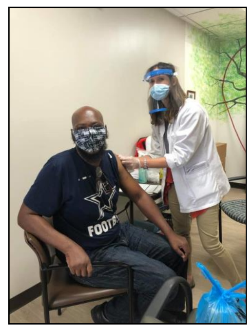
CCC Patient & Walgreens Pharmacist