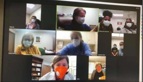
Zoom Staff Meeting