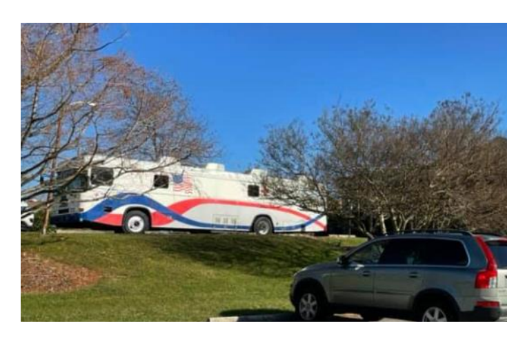
American Red Cross Mobile Unit

cases. All donations were tested for COVID-19 antibodies and many patients hospitalized with COVID-19 are receiving antibody treatments from donations like those from our local blood drive. "Donating blood during the pandemic is a meaningful way to serve your local community and give back in a socially-distant and safe way," said Caroline Parrott, Medical Assistant.