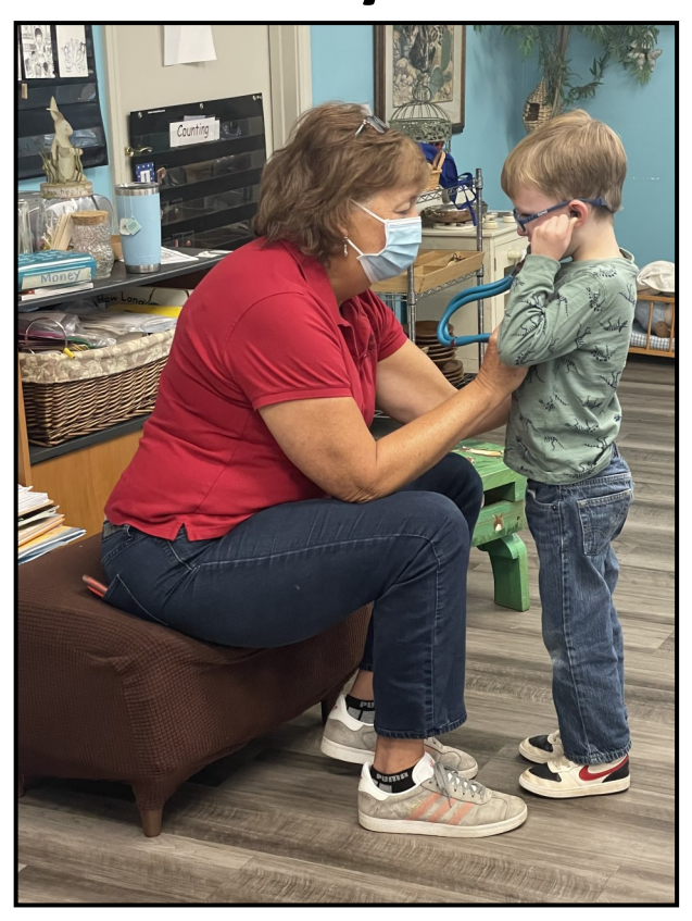
Salisbury Academy JK & K Giving Party