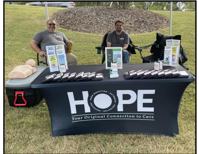
Hope 4 Rowan Narcan Giveaway