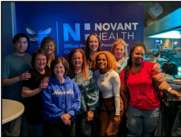
Novant Health Mammography Bus (top) Charlotte Hornets game (bottom)