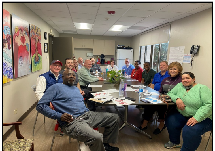
2023 Board of Directors

For every dollar donated, the clinic provides $9 worth of medical/dental care.