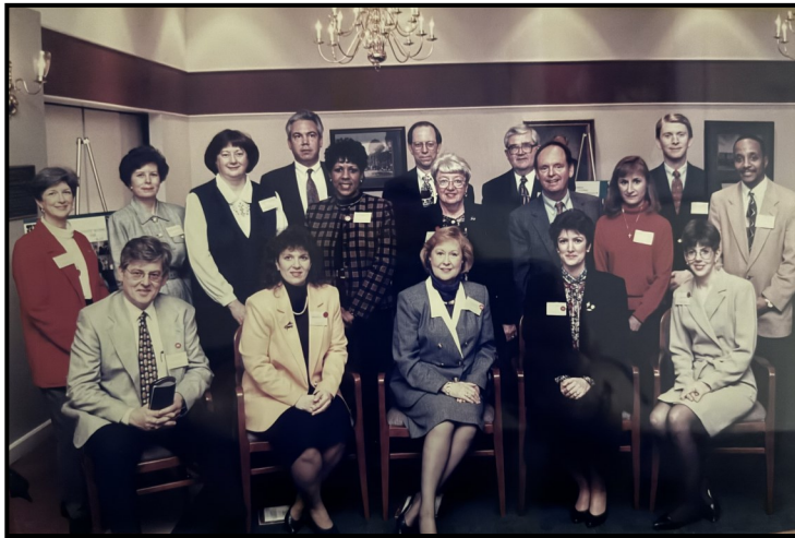
1996 Board of Directors

For years the Community Care Clinic knew that services provided at 315 Mocksville were saving the big building down the street lots of money by diverting non-emergent care away from the hospital. Over the years, clinic staff has worked diligently in educating patients on what is an emergency and what can be treated in a clinic. In fact, several years ago, the clinic and Healthy Rowan produced "Accessing Healthcare in Rowan County" – a brochure that shows, by expense, how much a visit costs at safety net clinics vs urgent care and the emergency department. This guide shows residents in the coverage gaps just how expensive care can be. Visiting an emergency department for routine care hurts everyone. Overall costs within a hospital are greatly reduced if money, time, and provider hours are not charged against patients that cannot pay. Ultimately, those that can pay are charged more to recover this loss.