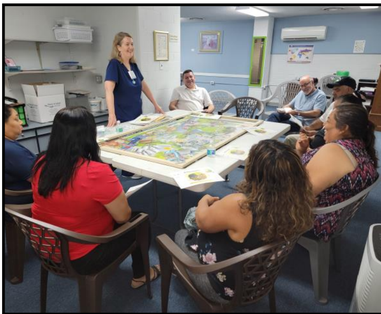
Good Shepherd's Clinic patients and diabetes educator discussing the risk factors and ways to overcome them when diagnosed with diabetes

The clinic is available to Rowan County residents, age 19 or over, who have no access to insurance, Medicare, Medicaid or VA benefits and earn less than 300% of the Federal Poverty Level.