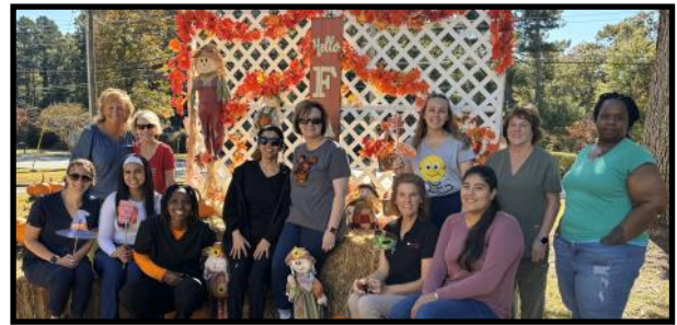
Pumpkin Patch at Milford Hills