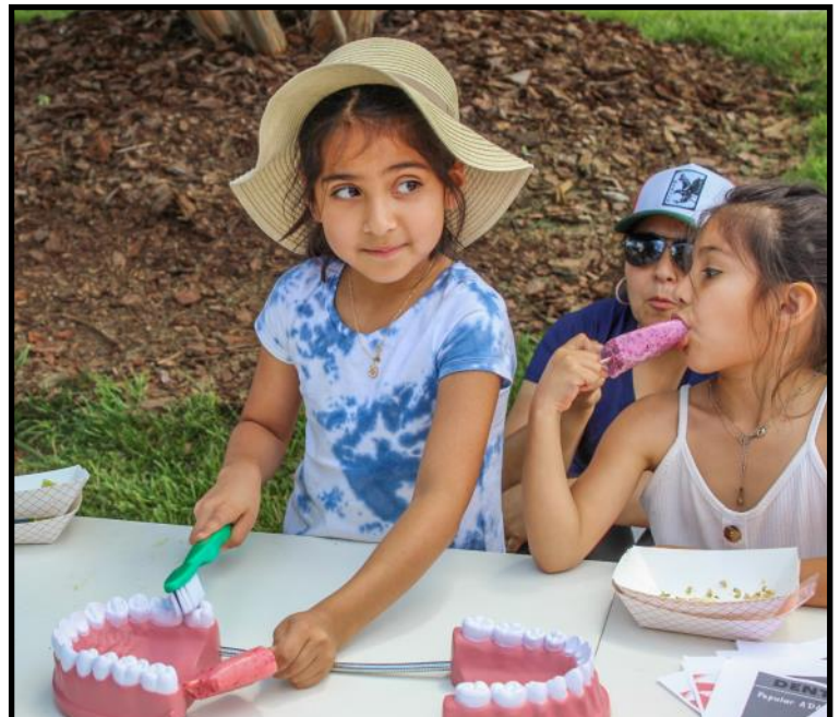
Families learning about proper brushing techniques

As the clinic looks ahead, Patient Appreciation Day is set to become an annual tradition – serving as a day to honor and celebrate all who have entrusted the clinic with their care and to remind every patient - past, present, and future - that they will always be part of the clinic family.