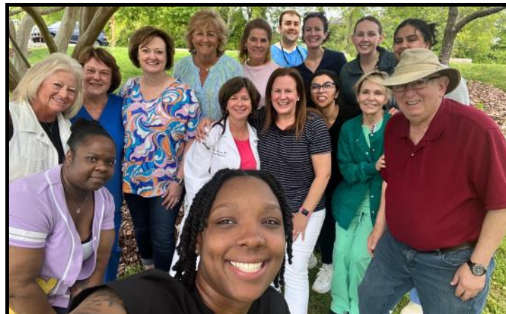
Community Care Clinic Staff

The Community Care Clinic of Rowan County provides medical, dental and pharmacy services to over 800 uninsured adults in Rowan County.