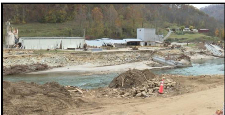
Burnsville, N.C. field hospital (top) Storm damage in Green Mountain, N.C. (bottom)