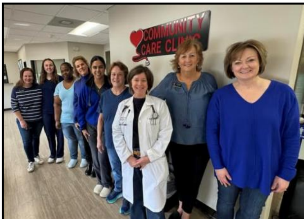
CCC staff dress in blue in honor of Colorectal Cancer Awareness in March