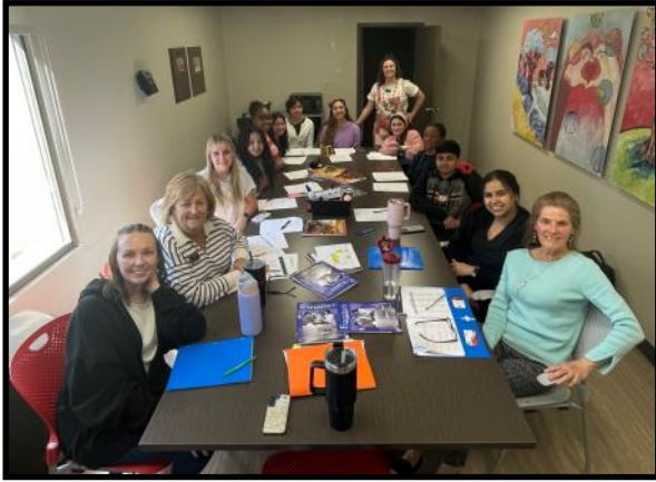
CCC Staff at Literacy Council Training