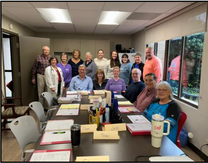
First Lifestyle Medicine Class