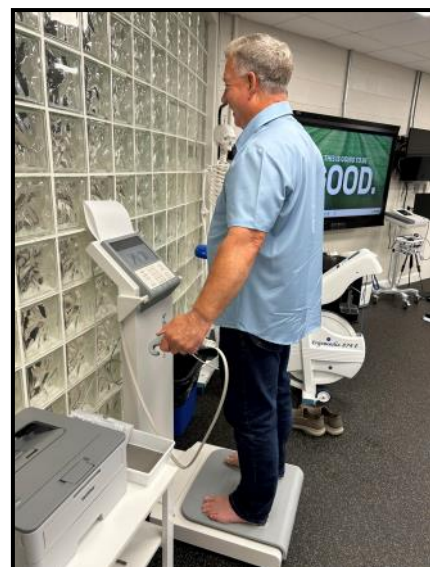
Participant doing body composition scan

If you or someone you know is interested in the class, please contact the clinic at (704) 636-4523. The classes run from February-April and September-November of each year.