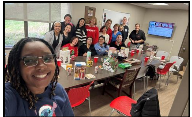
Community Care Clinic staff celebrating Christmas 2025

The Community Care Clinic of Rowan County provides medical, dental and pharmacy services to over 800 uninsured adults in Rowan County.